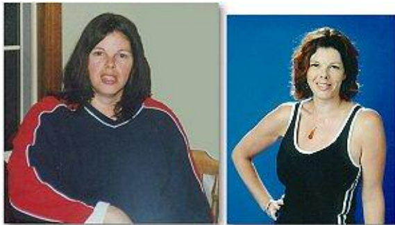
Before Immune Diet